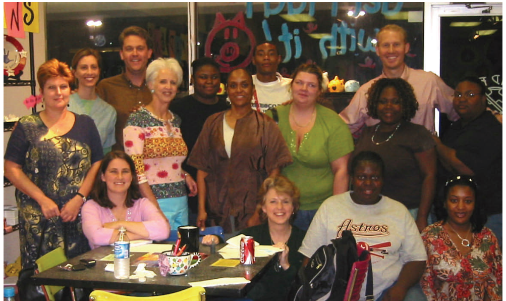
Mentorship group having a fun night out at the Mad Potter