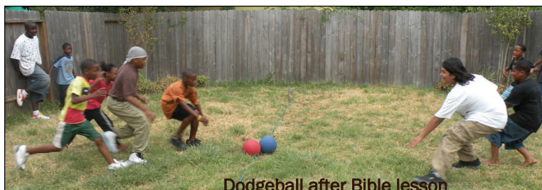
Dodgeball after Bible lesson

younger. Agape provides value by offering a safe, healthy activity where the gospel is preached in word and action. If you would like to volunteer to help us for a session, please contact us at 713-658-1001 or Volunteer@agapedevelopment.org .