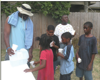
Staying cool this summer

Sign up for e-News at www.agapedevelopment.org