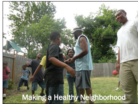
Making a Healthy Neighborhood

However, I believe that some problems require the gospel of Jesus