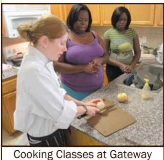
Cooking Classes at Gateway

Sign up for e-News at www.agapedevelopment.org